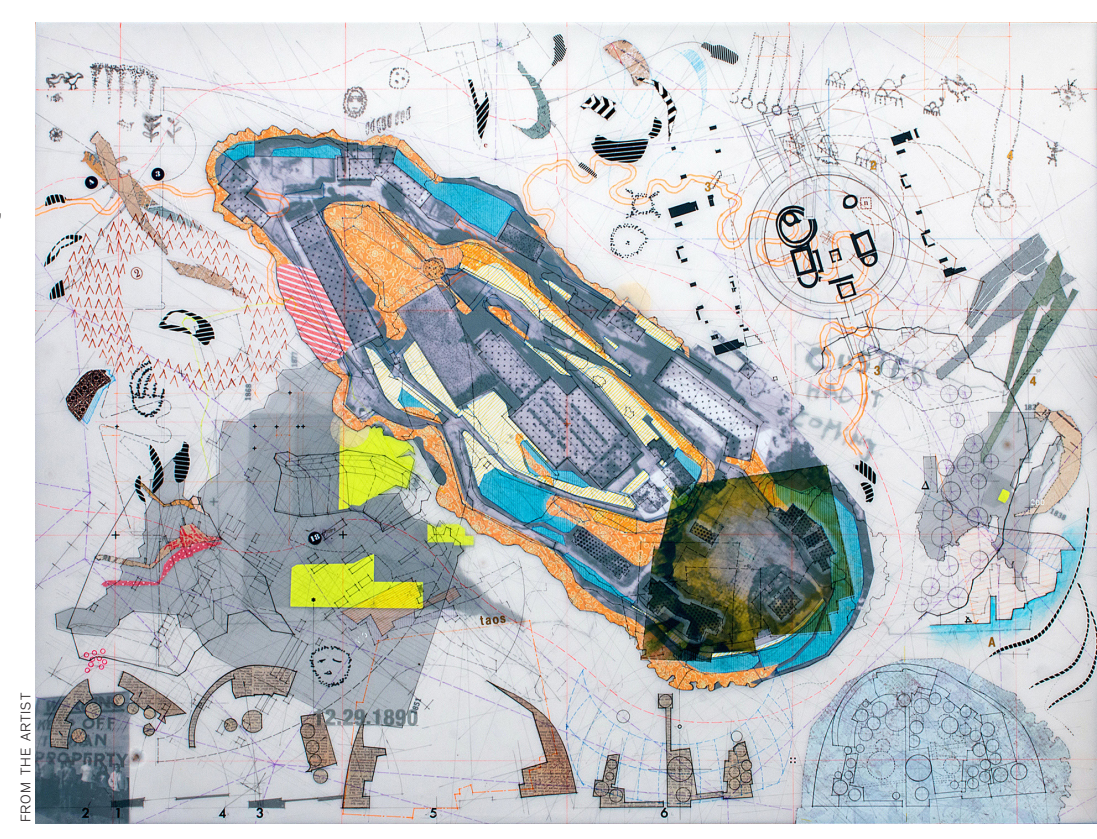
In "Radio Free Alcatraz: Territories," Cornelius applied his precise draftsmanship to an imaginative reexamination of the American Indian occupation of Alcatraz Island from 1969 to 1971.

In "Rituals" the artist displays his weavings on slanted pedestals that allow you to look into the intricate patterns contrasting fiber colors with rich natural dyes in red and black. Behind them on the wall are life-size